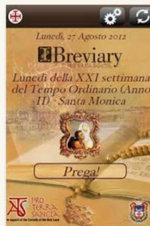
Free Liturgy of the Hours for phone/tablet