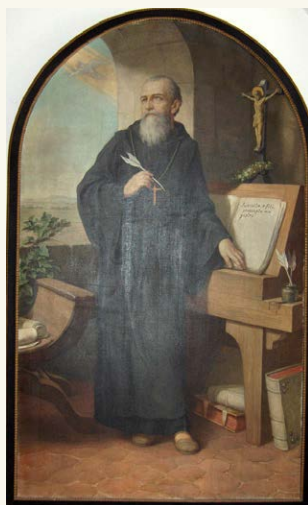
Rule of Saint Benedict