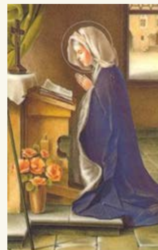
St. Gertrude the Great